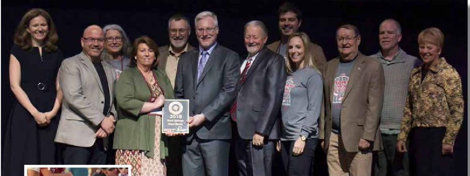
Great American Main Street Awards winner!