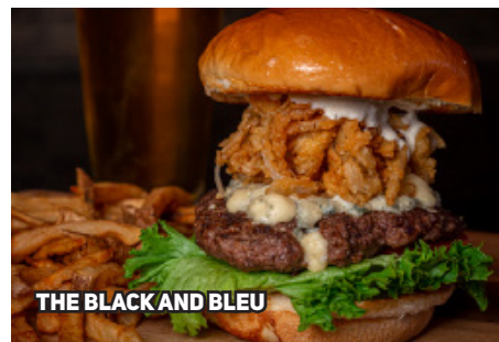
THE BLACK AND BLEU