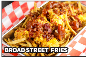
BROAD STREET FRIES