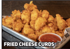
FRIED CHEESE CURDS

fries loaded with bacon, gouda cheese, and black truffle sauce .. 11.79