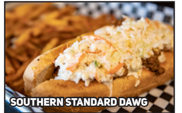
SOUTHERN STANDARD DAWG

a classic all-beef hot dog topped with pimento cheese, sweet heat jam, and bacon .. 11.29