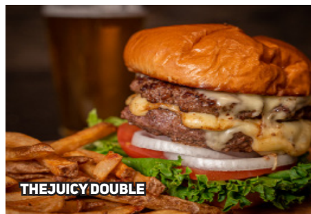
THE JUICY DOUBLE