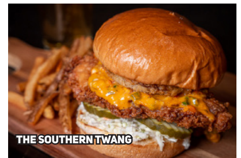
THE SOUTHERN TWANG