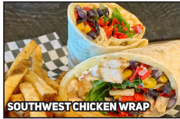
SOUTHWEST CHICKEN WRAP

classic bacon, lettuce, and tomato with fried bologna on sourdough bread .. 10.99