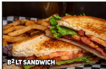
B 2 LT SANDWICH