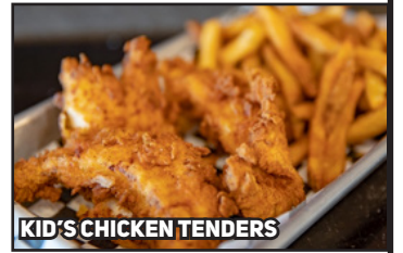
KID'S CHICKEN TENDERS