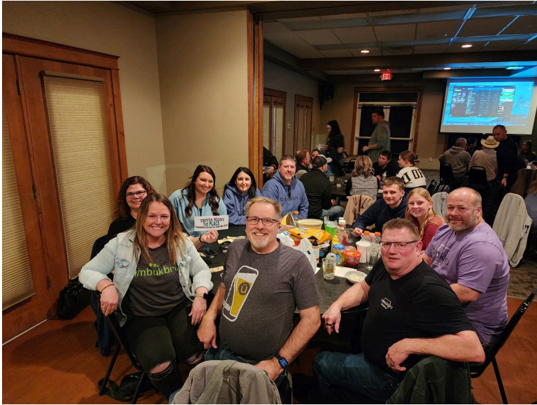
1 st place: The Trivia Kru