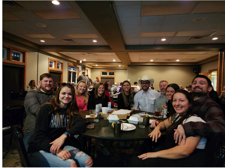
2 nd place: Quiz Me Baby One More Time