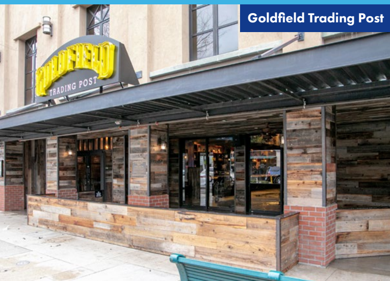
Goldfield Trading Post