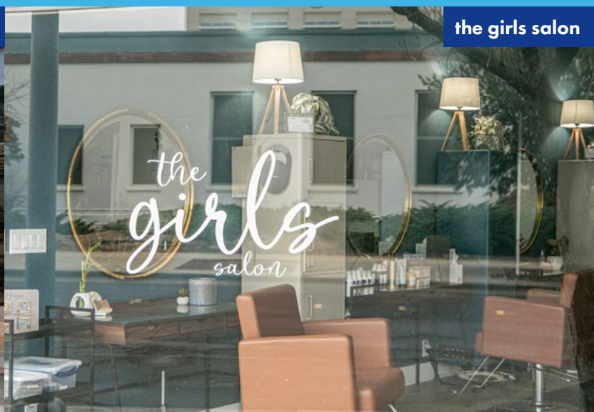
the girls salon