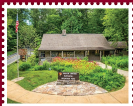
Catocin Mountain Park (Free Electric Vehicle Charging Station)