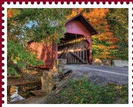
Roddy Road Covered Bridge