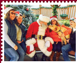
Christmas in Thurmont