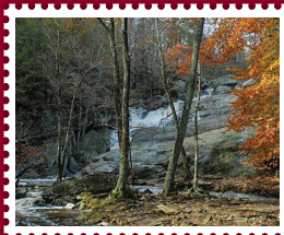
Cunningham Falls State Park