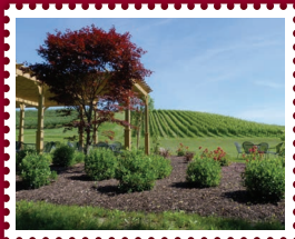
Catocin Breeze Vineyard

Come Back To See Us During Any Season! Relax. Recreate. Retreat.