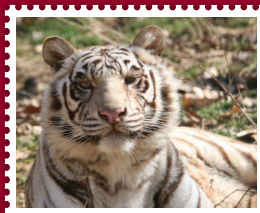
CATOCIN WILDLIFE PRESERVE & ZOO