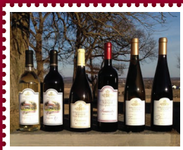
Springfield Manor Winery & Distillery