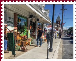
Down on Main Street