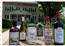
Springfield Manor Winery & Distillery