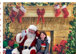
Christmas in Thurmont