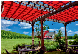
Catocin Breeze Vinyard

Come Back To See Us During Any Season! Relax. Recreate. Retreat.