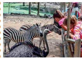
Catocin Wildlife Preserve & Zoo