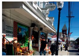
Down on Main Street