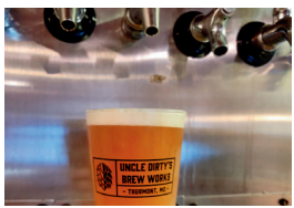
Uncle Dirty's Brew Works