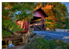
Roddy Road Covered Bridge