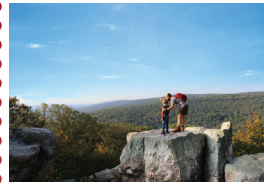
Catocin Mountain Park