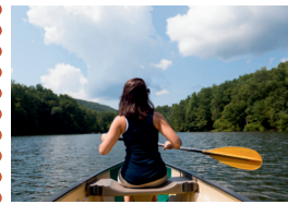
Cunningham Falls State Park