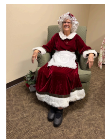
Scenic City Holiday Hop! The "elves" and Mrs. Claus...